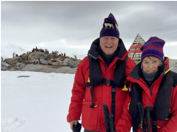
Our first day on the Antarctic continental adventure