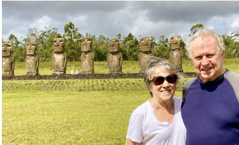
The Gerards' first day on Easter Island