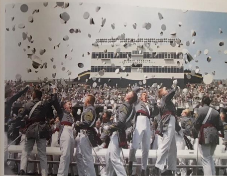
Throwing of Hats 2018

Once all members of the graduating class had received their diplomas and commissions, the Commandant administered the Oath of Office, the Alma Mater was sung and on the order "Class Dismissed," the Class of 2018 threw their white hats high into a spectacularly blue sky backdrop - just as the Class of 1968 had done a half-century before.