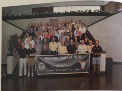
Class of 1968 March Back Attendees